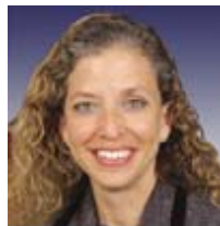
Debbie Wasserman Schultz

Bill Is Designed to Lower Drug Costs For Thousands of South Florida Seniors and People with Disabilities.